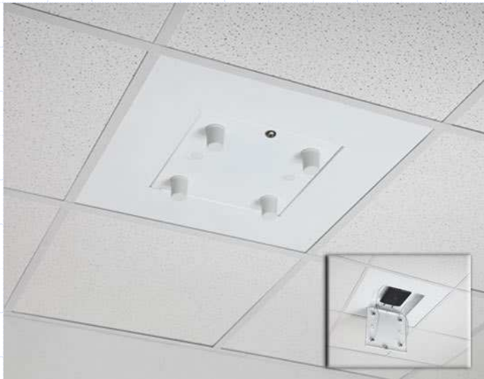
Wireless AP enclosure

We manufacture ceiling and wall mounted Telecommunications Enclosures (TEs) for wireless LAN access points and other networking components