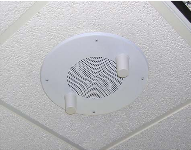
Model 1039-00 shown with (2) optional 34-ZDUAL antennas (not included)

Oberon's Model 1039-00 mounting solution for antennas provides an aesthetic, economical, convenient mounting solution for wireless LAN antennas. The mounting plate is similar to a conventional speaker grill with openings to mount wireless LAN antennas. The speaker grill is attached to a tile bridge, which supports the speaker grill, antennas, and, if desired, the wireless access point. The speaker grill serves as an excellent ground plane for up to four antennas. The product is designed to satisfy National Electric Code (NEC) paragraphs 300-22 and 300-23 for installation in the air handling space. The mounting solution can be used with Oberon's 34-ZDUAL, 34-DMDUAL antennas, or 35-BULKHD-KIT-RPSMA(F) or 35-BULKHD-KIT-RPTNC(F) adaptors for dipole antennas (not included).