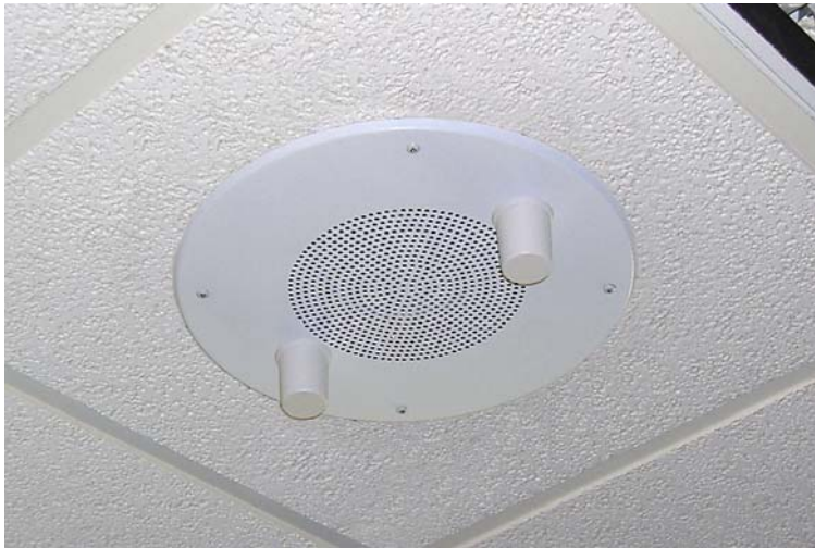
Model 1039-00 with Oberon 34-ZDUAL antennas (not included)

Oberon's model 1039-00 mounting solution for antennas provides an aesthetic, economical, convenient mounting solution for wireless LAN antennas. The mounting plate is similar to a conventional speaker grill with openings to mount wireless LAN antennas. The speaker grill is attached to a tile bridge, which supports the speaker grill, antennas, and, if desired, the wireless access point. The speaker grill serves as an excellent ground plane for up to four antennas. The product is designed to satisfy National Electric Code (NEC) paragraphs 300-22 and 300-23 for installation in the air handling space. The mounting solution can be used with Oberon's 34-ZDUAL, 34-DMDUAL antennas, or 35-BULKHD-KIT-RPSMA(F) or 35-BULKHD-KIT-RPTNC(F) adaptors for dipole antennas (not included).