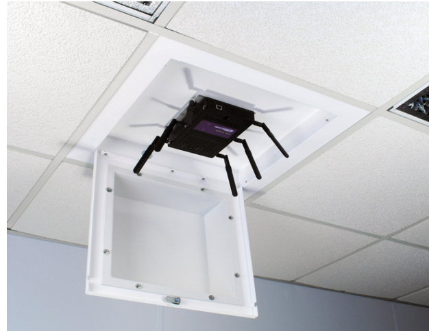
Model 1059-00 shown with C Extreme Networks Altitude 4620 wireless AP and standard dipole antennas (not included)